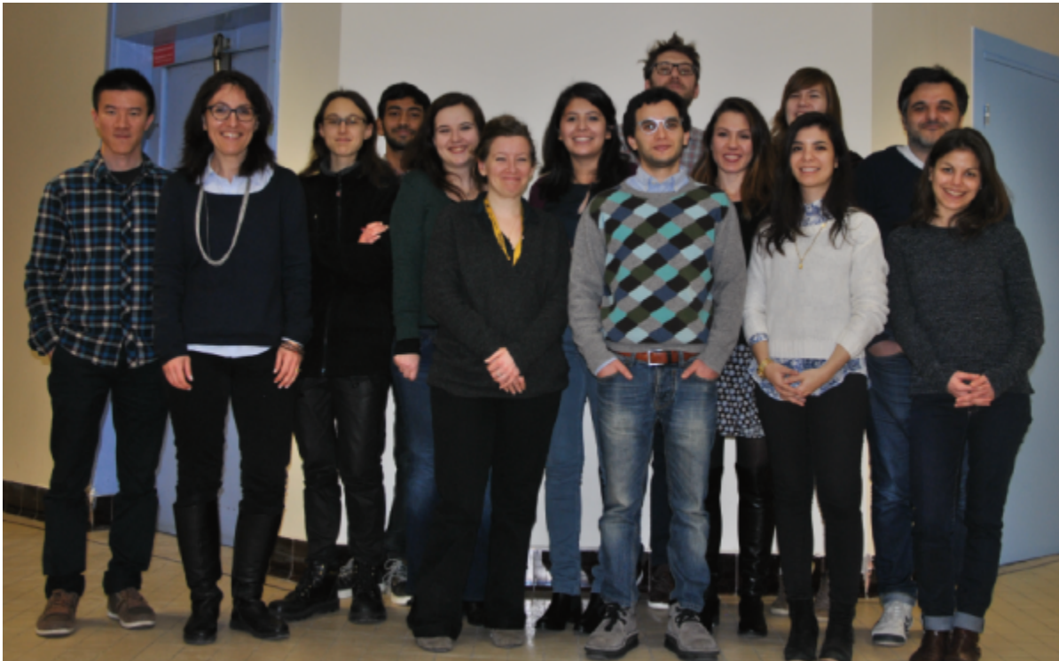
The Team March 2016